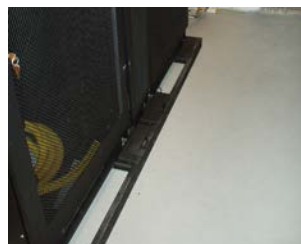
Equipment Racks on Seismic Isolation Pads

The ice rink in which the co-location facility resides is single story "at grade" structure built on bedrock using reinforced concrete block construction at an elevation of 500 feet above sea level. The windowless co-location facility was built as completely separate reinforced concrete bunker within the new ice rink for additional security and survivability.