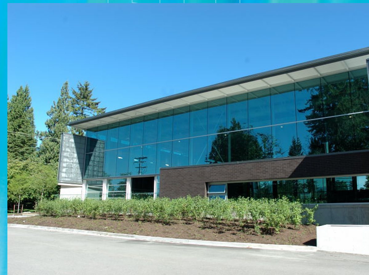
The Poirier Sport And Leisure Complex