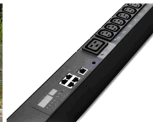
PDU Providing Power Management & Remote Outlet Switching Capabilities

the server room. Power is delivered into the equipment cabinets via Avocent™ power distribution units (PDU's), each on a breaker of 30A over 208V. The power fail-over system is tested on a monthly basis.